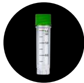
1.5ml External Thread