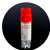
2.0ml External Thread