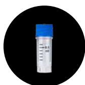
0.5ml External Thread