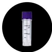
1.0ml External Thread