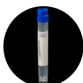
5.0ml External Thread