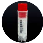
2.0ml Internal Thread