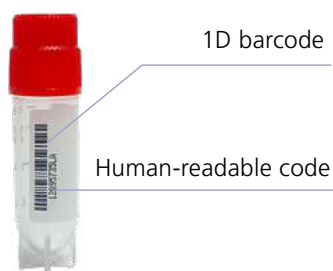
1.0ml, 1.5ml, 2.0ml and 5.0ml vials