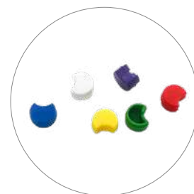
Inserts fit 2.0ml and 5.0ml vials' caps