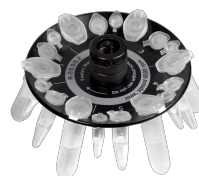
R-2/0.5/0.2 BS-010205-DK rotor

Rotor for 8 x 2/1.5 ml and 8 x 0.5 ml microtest tubes